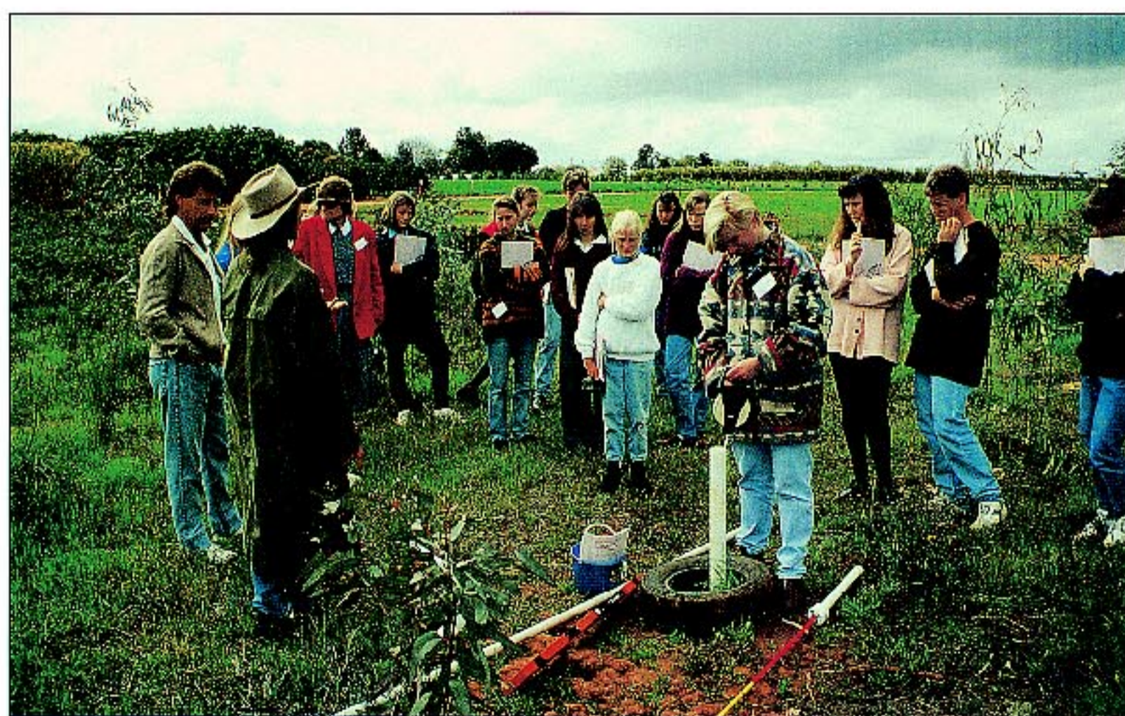
Salt Action's community education program involves schools from all over NSW.