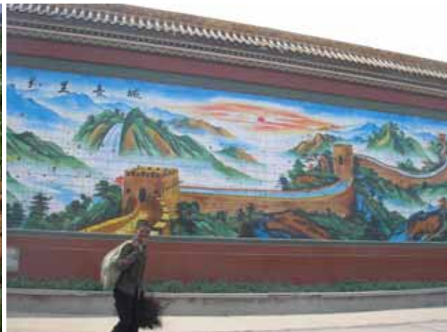
Figure 3 - Chinese farmer in Shanxi Province