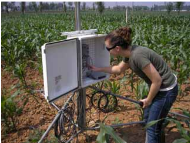
Figure 2 - Past Field work in China

I have previously undertaken 2 research projects in China. The first was in 2006, through an International Undergraduate Program from the University of Melbourne. This project aimed to understand the attitudes and beliefs regarding water use that were considered by irrigation farmers in an irrigation district in Shanxi province. The second project, in 2007, formed part of my honours project and included being involved in the planning process for the Shanxi Province Irrigation and Modernisation Plan. Therefore, as I already had some insight into both the on the ground and Provincial government irrigation activities, my primary aim in China for the fellowship was to understand the interactions at the National level. As all Provinces in China act with a certain amount of autonomy, I saw this as important, particularly with respect to the recent assertion from the Federal Government in Australia.